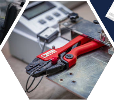
Service & Maintenance