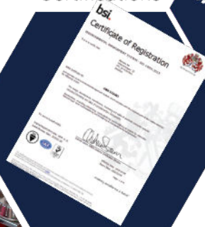
Standards & Certifications