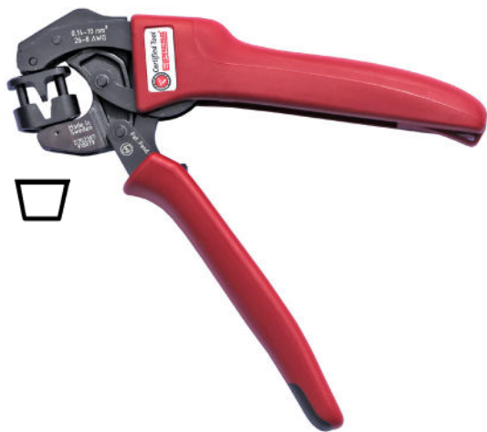
PEB0110T, crimping area 0.14-10 mm 2 , front and side feed