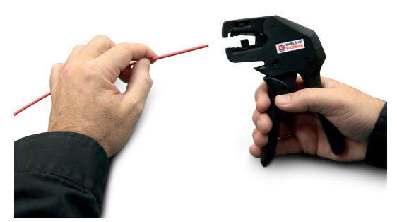
Accessories All EMBLA RA version can use the different exchangeable knifes.